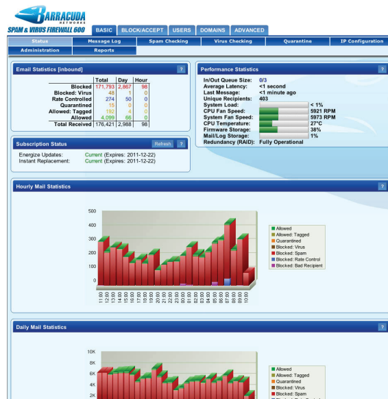
The Barracuda Spam & Virus Firewall Vx filters all email messages and displays the number of emails received with statistics on how they were processed.

The Barracuda Spam & Virus Firewall Vx is available in four editions handling up to 10,000 email users. Multiple Barracuda Spam & Virus Firewalls can be clustered for more capacity and high availability.